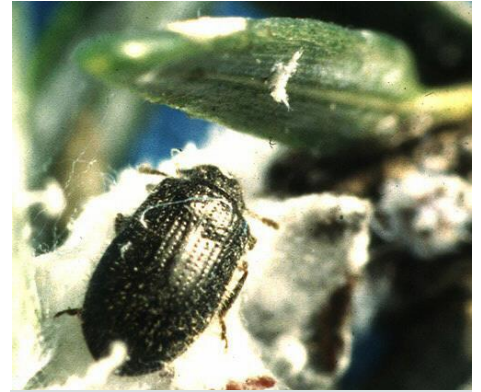
Laricobius nigrinus feeding on HWA

Chemical insecticides can be used to treat an already infested tree or as a preventive measure in a high-risk infestation area. They are useful for treating individual, ornamental, or high-value trees, but are not practical or economical in a forest setting. Two insecticides that have shown promising results are Imidacloprid and Dinotefuran. Both must be applied by a licensed pesticide applicator, and either can kill HWA on its own. Applying both insecticides to an infested tree, however, combines the immediate effectiveness of the fast-acting Dinotefuran with the long-term protection of Imidacloprid, leaving the tree adelgid free for up to seven years.