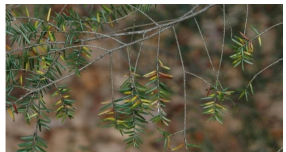
HWA damage to needles and branches