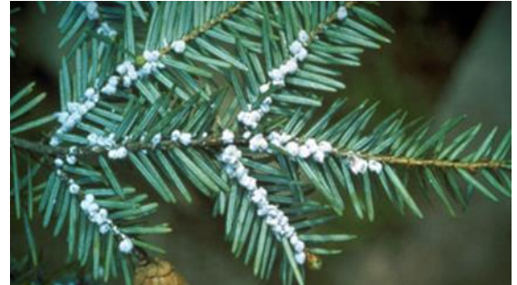
White woolly ovisacs on a branch of eastern hemlock